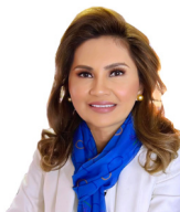
Rozanne 'Twinkle' Cocon-Gambo Governor, District 3860 Zone 3D